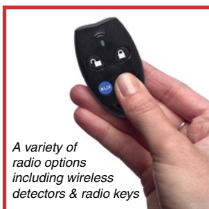
A variety of radio options including wireless detectors & radio keys