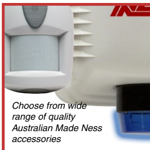
Choose from wide range of quality Australian Made Ness accessories

ECO8x is fully monitoring capable and ready for back-to-base monitoring or you can even have it call your mobile phone and speak an audible alarm message.