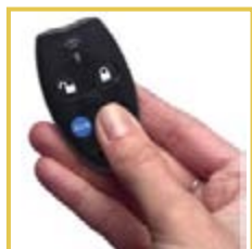
RADIO KEY OPERATION Optional