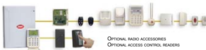
OPTIONAL RADIO ACCESSORIES