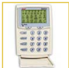
KEYPAD OPERATION Standard

A new range of X Series slide-in accessory boards includes a four Relay Board, a Reader Interface and the new X Series Output Expander for both the D8x and D16x panels.