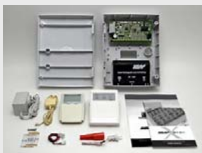
D8x Panel with LED keypad Part No. 106-000