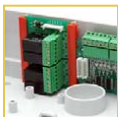
NEW ACCESSORY BOARDS Optional