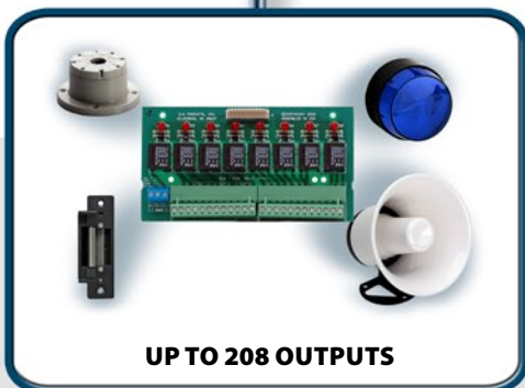
UP TO 208 OUTPUTS

Up to 16 keypads can be added to the EZ-24 on the data bus. Add more EZ-24 keypads or choose from any of the variety of keypads and touch screens in the Ness EZ-24 range.